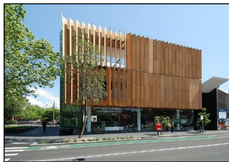
Surry Hills Library and Community Centre